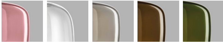
AATR CRTR FUTR TBTR VATR